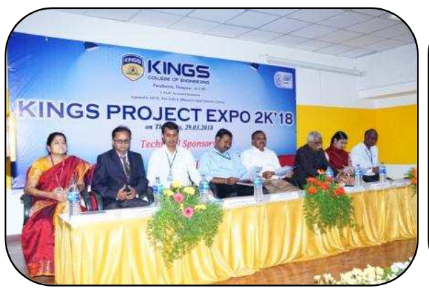
Dignitaries on the Dias