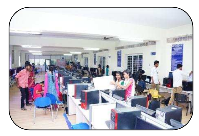
View of the projects displayed at the EXPO